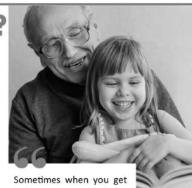
Sometimes when you get to be my age, you wake up and say what good am I and along came the Foster Grandparent Program that keeps me going! "

The Foster Grandparent Program is hosted by the Catholic Charities of the Diocese of Ogdensburg and supported by AmeriCorps Seniors, a federally funded agency responsible for building volunteer based programs for over 50 years and counting.