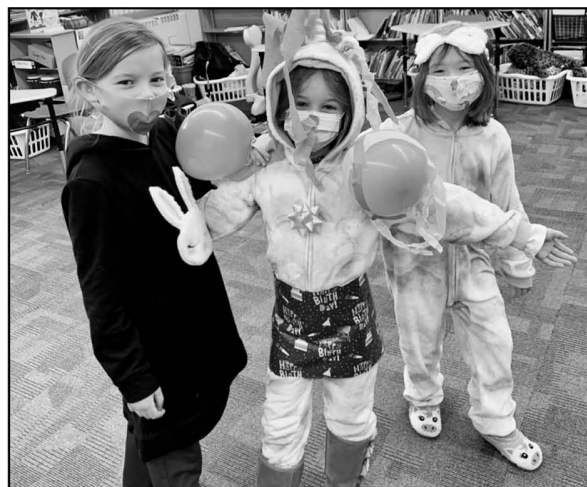
As part of their Catholic Schools Week activities, students at St. Agnes School in Lake Placid wrapped each other like gifts to symbolize that they are all gifts from God!